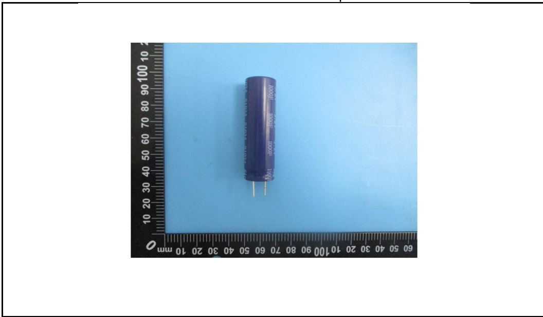
Photo of Submitted Sample